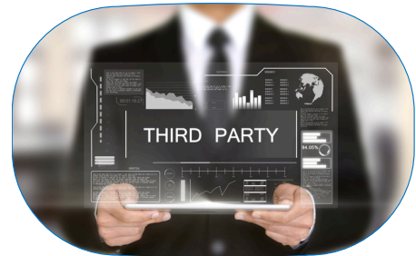
THIRD PARTY ADMINISTRATION